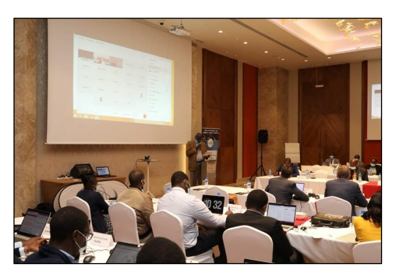
Participants in the Phase 1 INIR Follow-up mission, Kenya

Kenya, which has Africa's seventh-largest economy and a population of 52 million people, is considering the introduction of nuclear power to help meet its growing energy demand. The Kenyan Ministry of Energy has proposed the potential use of nuclear energy for power generation. In 2019, the Kenya Nuclear Electricity Board (KNEB) transitioned to the Kenya Nuclear Power and Energy Agency (NuPEA) to undertake preparations for the development of a nuclear power programme.