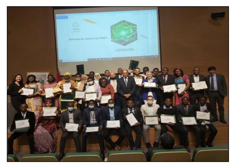
Group photo, PGEC closing ceremony, Rabat 2021

Following discussions with their course supervisors, the participants selected suitable project work topics to demonstrate the knowledge and skills acquired during the course. Each participant's project focused on solving a specific radiation protection problem in their home country and was presented at the end of the course.