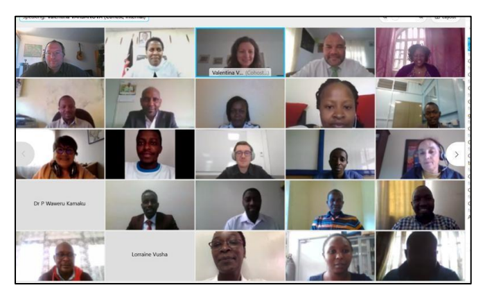
Participants attending the virtual NTC under KEN7006

To support this goal, a virtual National Training Course on Isotope Hydrology and Introduction to IWAVE for Kenya took place over three days in May 2021, within the framework of TC project KEN7006, 'Developing a Comprehensive Water Sector Assessment towards the Sustainable Management of Water Resources by Using the Water Availability Enhancement Approach'.